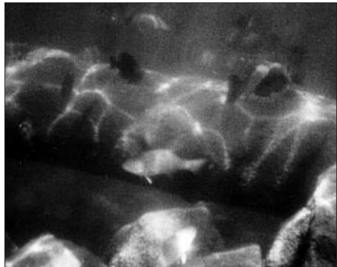
Underwater structures give fish a place to rest, hide, feed and spawn.

These are usually green, oak logs sawed lengthwise. They are either anchored (flat-side down) to the bottom by steel rods, or suspended from concrete blocks. They are best used in downward-sloping streams or shallow areas of ponds and lakes. Keep in mind that the river bottom must be firm and that routine maintenance will be required.