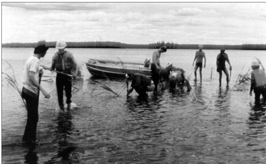
Planting aquatic vegetation provides protection and spawning and food-production areas for small fish.

There are a number of structures that can improve habitat in streams. For example, deflectors can be built to concentrate or redirect water flow and to restore meandering streams. Digger logs can be used to create small pools. Floating platforms can be installed on a seasonal basis to provide overhead cover. Angled log pilings can be inserted into stream beds to create mid-channel feeding areas. Log wedge dams can be built in trout streams to create pools. Artificial structures can be built along the shoreline to create overhanging cover and to undercut banks.