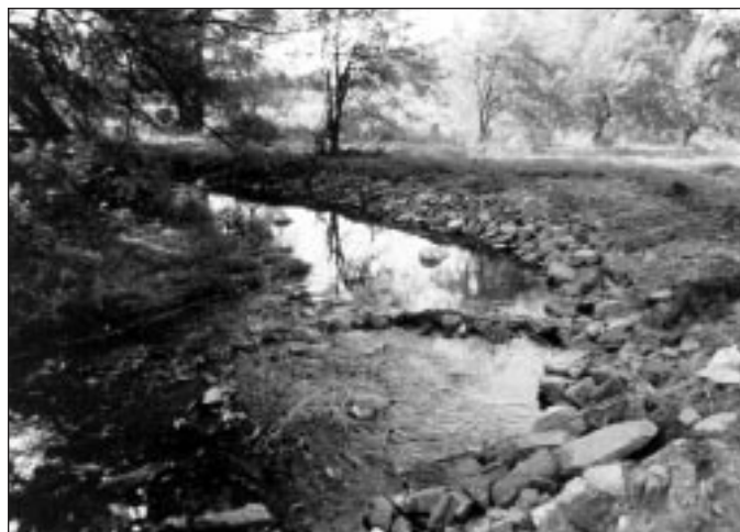
Deflectors in streams concentrate or redirect water flow to restore meandering streams.

In large water bodies, such as the Great Lakes, artificial reefs are often the best method of creating habitat. Reefs should be constructed of large boulders and clean rip-rap material submerged in at least three to six metres of water.