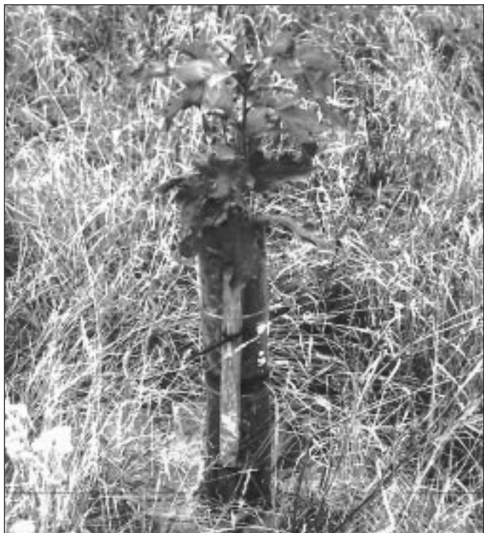
A stack of four plastic pop-bottles protects saplings from weather, small mammals and equipment.