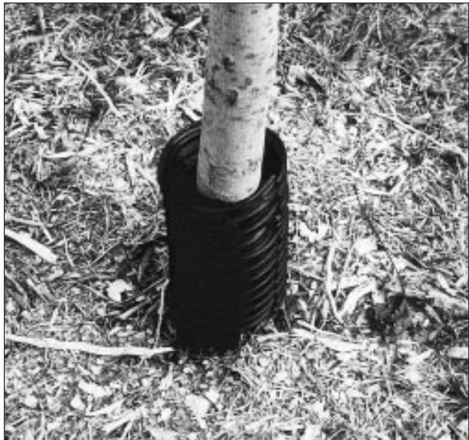
Field tile protects trees from weather, small mammals and equipment. White field tiles are preferable to black.

Note: The mention of trade names of products is for the convenience of the reader and does not constitute endorsement of a particular product by the Ministry of Natural Resources to the exclusion of any other suitable product.