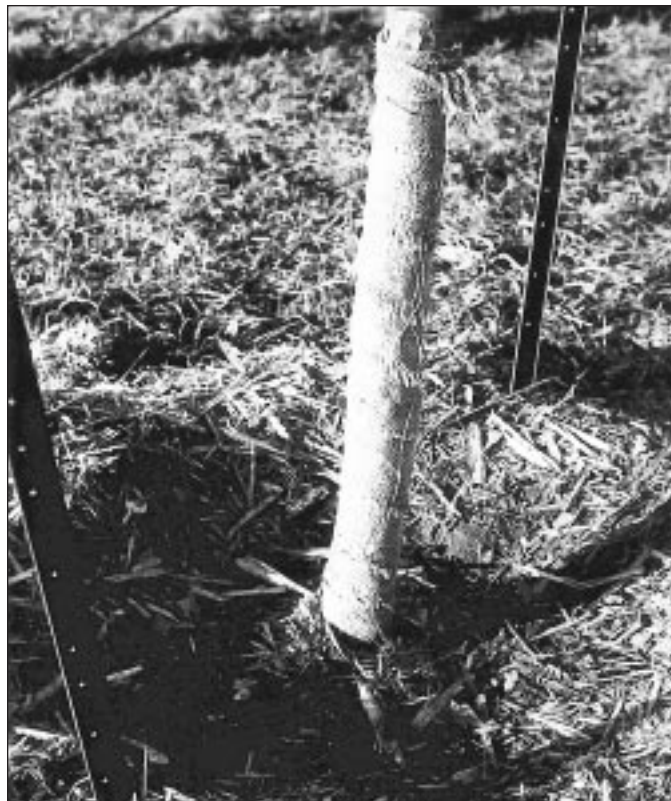
Loosely wrapped and secured with rope, burlap protects trees from extreme temperatures.

Hardware cloth protects trees from animals and equipment, but it doesn't protect them from weather. Place the hardware cloth around the tree, but not touching it. The bottom of the wire should extend five