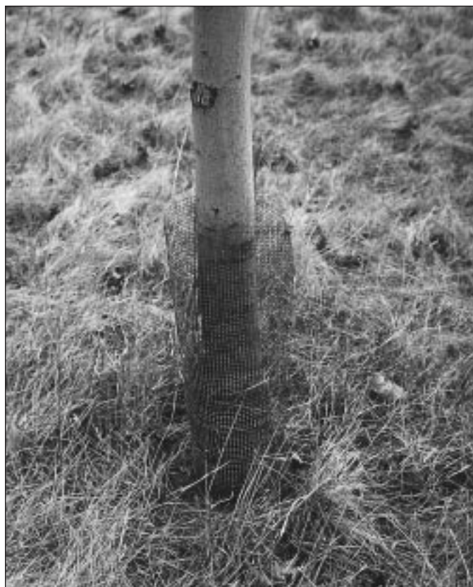
Hardware cloth protects trees from voles and other small mammals.